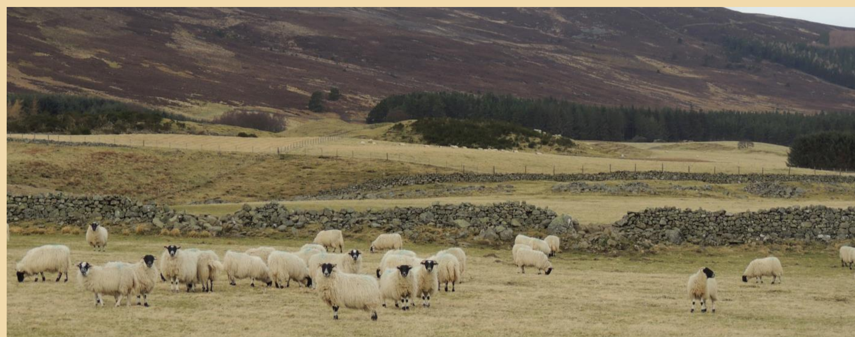
Fig. 2. Sheep grazing at Auchnerran