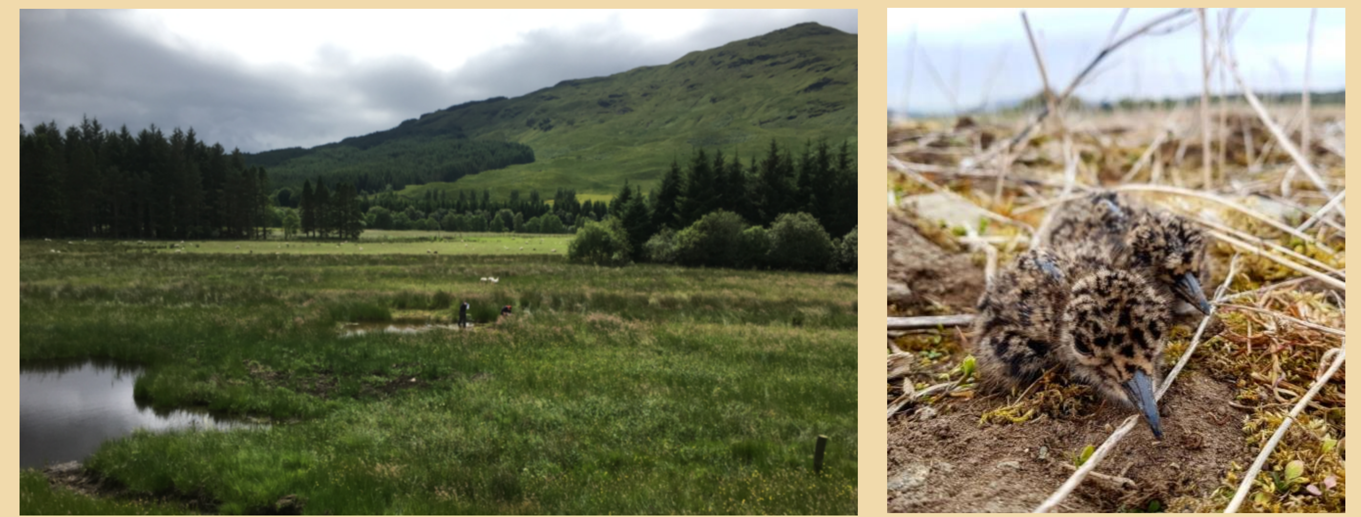
Fig. 3. (a) Newly installed wader scrapes at SRUC Kirkton, with in-bye fields beyond (b) Lapwing chicks

Where? – in and around wader scrapes at SRUC's Kirkton/Auchtertyre farm in collaboration with RSPB