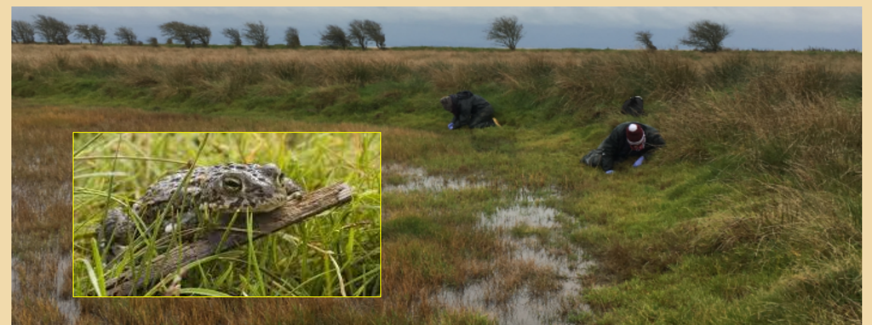
Fig. 4. Mud snail sampling on the Solway Firth. Inset, natterjack toad

Where? The only populations in Scotland are on the Solway Firth and the work is in collaboration with SNH & ARC-Trust.