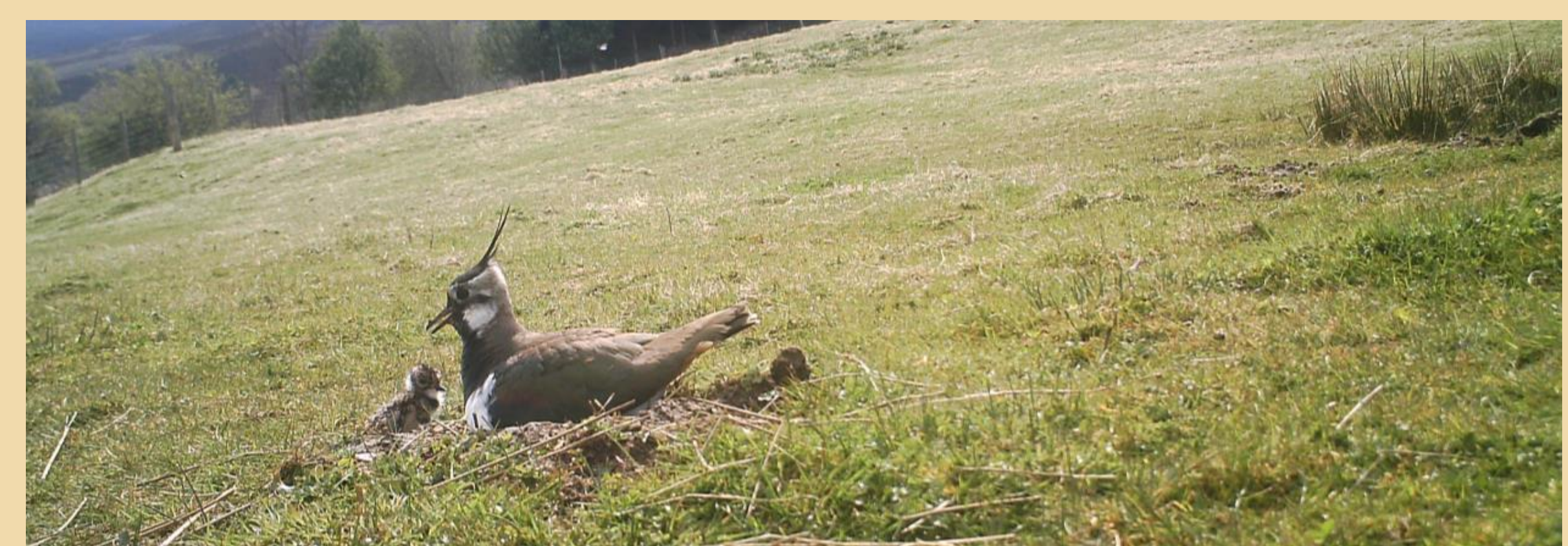
Fig.5. Lapwing nesting site at Auchnerran, image © Marlies Nicolai, GWCT.

Where? – monitoring the effect of liming on sward productivity and invertebrates, including mud snails is taking place at the Game & Wildlife Conservation Demonstration Farm at Auchnerran in collaboration with JHI.